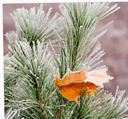
FROSTED LEAF IN PINE