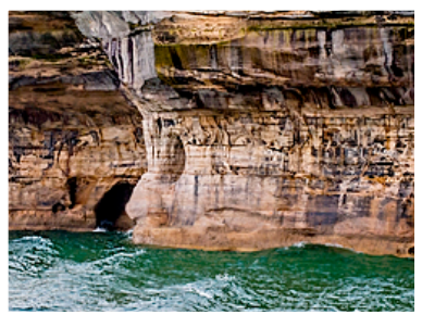
PICTURE ROCKS NLS