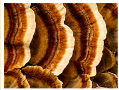
TURKEY TAIL FUNGUS