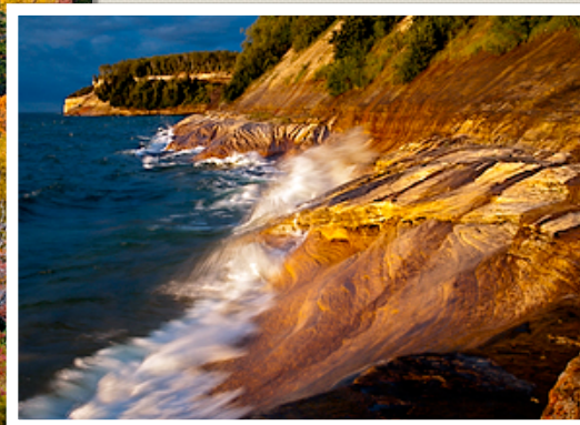
PICTURED ROCKS NATIONAL LAKESHORE (ABOVE)